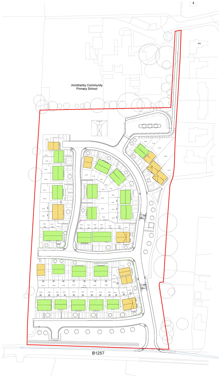
Proposed Site Plan - Scale 1:500